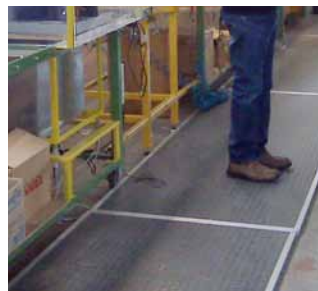
Finishing in black bubbled PVC