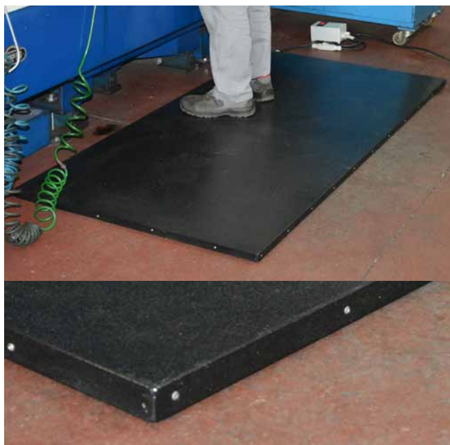
Quartz painted steel finishing